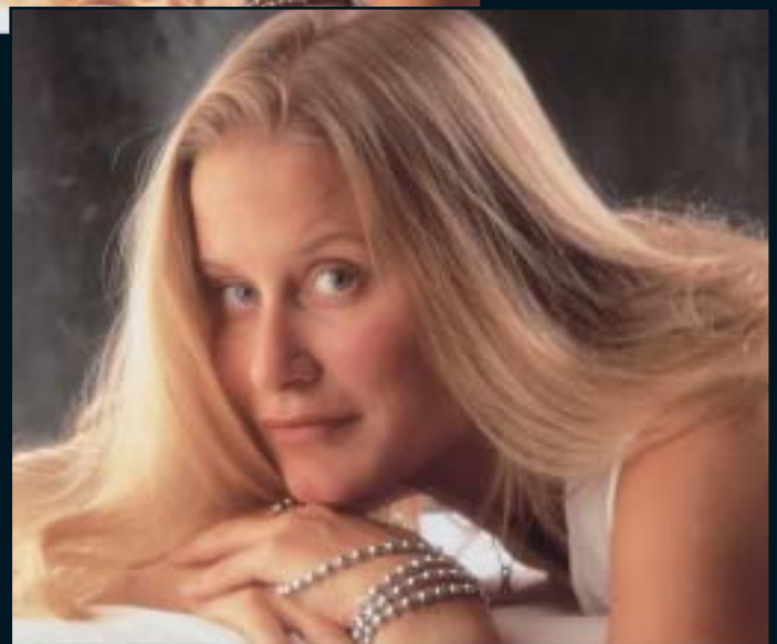
Black Diffusion/FX 5 filter